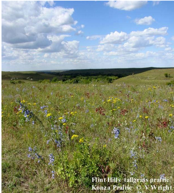
Flint Hills tallgrass prairie Konza Prairie

Approximately four percent of our nation's original tallgrass prairie remains intact, and ninety-five percent of this prairie is in Kansas. Whether in vast acreages in the Flint Hills or small roadside remnants in the Glaciated Region, Kansans have an extraordinary opportunity as stewards of these vestiges of our natural heritage. Remnant prairies protect ecological diversity and provide habitat for increasingly rare species. They are also valuable blueprints for future prairie restoration efforts.