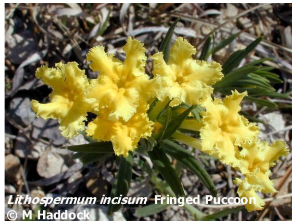
Lithospermum incisum Fringed Puccoon

To get an idea of the diverse regions of Kansas, see the physiographic map of Kansas. Each region has a unique geology, which in turn influences the vegetation. Precipitation also greatly affects the distribution of plants in Kansas. Shortgrass and sandsage prairies are found in the west, with mixed-grass prairies in the west and central part of the state, and tallgrass prairie in the east. We have deciduous forests in the east, as well as floodplain forests throughout the state. Each of these regions has a unique blend of native plants. A visit to any region, no matter the season, is sure to reward the visitor with some memorable discoveries.