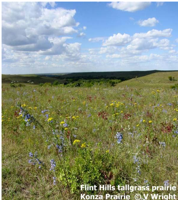
Flint Hills tallgrass prairie Konza Prairie

Approximately four percent of our nation's original tallgrass prairie remains intact, and ninety-five percent of this prairie is in Kansas. Whether in vast acreages in the Flint Hills or small roadside remnants in the Glaciated Region, Kansans have an extraordinary opportunity as stewards of these vestiges of our natural heritage. Remnant prairies protect ecological diversity and provide habitat for increasingly rare species. They are also valuable blueprints for future prairie restoration efforts.